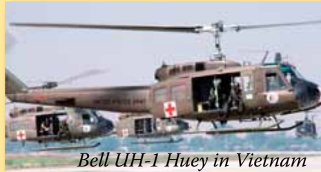
Bell UH-1 Huey in Vietnam

In April 1944, Japanese forces in occupied Burma shot down a Stinson liaison aircraft that had been carrying three wounded British soldiers to safety. The pilot and all three passengers survived the downing, but their location behind enemy lines in remote and rugged terrain would have permitted little opportunity for their rescue—except for the presence of a new technology at the front.