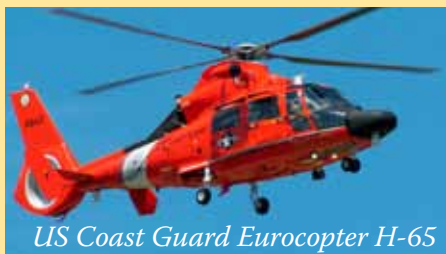
US Coast Guard Eurocopter H-65

Elsewhere in Asia, the United States further developed the role of helicopters for medevac operations. During the Korean War the US Army and Marine Corps were bedeviled by rugged terrain and poor roads. Helicopters such as the Hiller UH-12 (derived from the Hiller 360) and Bell 47 were tasked with transporting wounded soldiers to medical facilities. These helicopters evacuated an estimated 20,000 wounded servicemen during the war. By the end of the Korean War the fatality rate for casualties wounded in battle