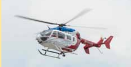
Stanford Life Flight helicopter

at major hospitals grew increasingly common.