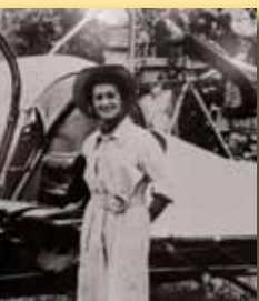
Valérie André with a Hiller 360