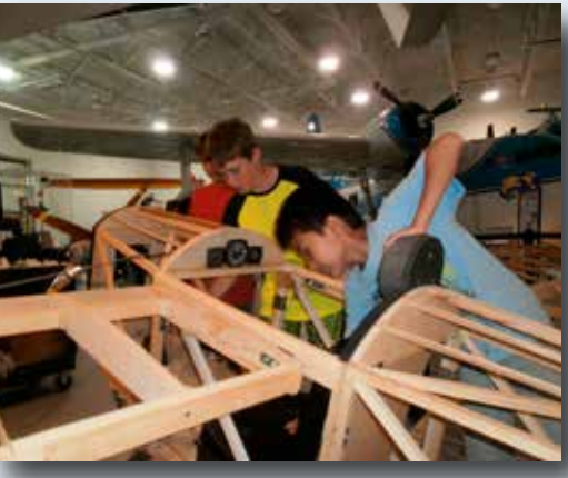
Penguin Airplane With Students at Hiller Aviation Museum

he training and preparation of new pilots has been an essential function since the dawn of modern aviation. Orville Wright's triumphant first flight on December 17, 1903, could be attributed in part to his brother Wilbur's crash in the same aircraft just three days earlier. When Wilbur first took the controls of the Flyer on December 14, he had no flight instructor upon whom to rely. The original 1903 Flyer was unstable in pitch, leading Wilbur to over-rotate and stall the airplane. When Orville's turn came on December 17 Wilbur shared his experience, making it possible for Orville to succeed.