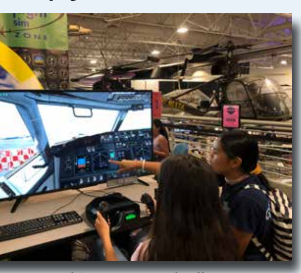
Girls' Aero Team and Hiller Museum flight simulators.

Commercial aviation grew tremendously after World War II. Pilot recruitment was not a serious challenge at first as military flight training programs had produced hundreds of thousands of skilled pilots and released them into civilian life. Many were happy to seize an opportunity to continue their piloting careers in peacetime. By the 1990s, however, the nature of pilot training had changed dramatically. Deregulation of the US airline industry caused demand for airline service to triple between 1975 and 2010. Concurrently, the end of the Cold War in the late 1980s significantly reduced the number of pilots being discharged from the military. Airlines increasingly sought to recruit new pilots from civilian flight training programs to fill out their ranks.