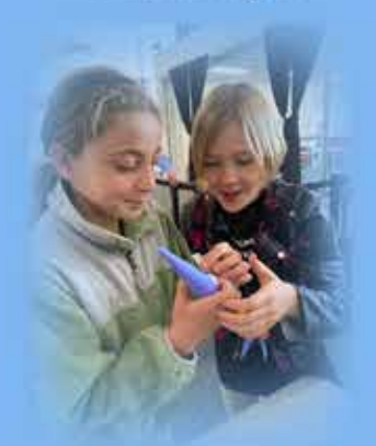
Physics Flyers Entering Grades K-5