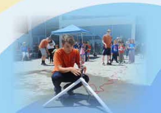
Air & Space Entering Grades K-5

Created for children entering Grades JK-8, Aviation Camp uses hands-on experiments, authentic flight simulation and real aircraft to provide week-long adventures in flight.