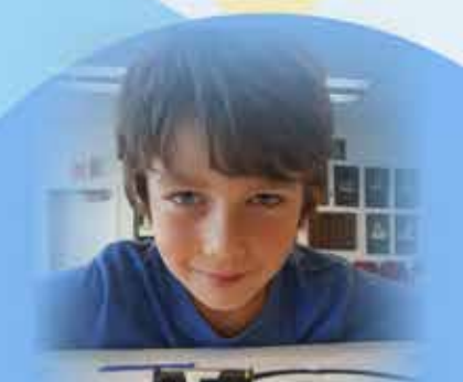
Aero Engineer Entering Grades K-5

Explore the universe and the science of spaceflight!