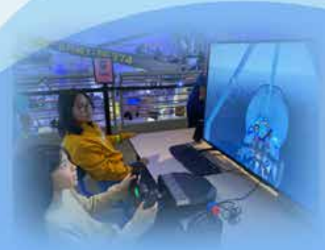
X-Plane Pilot Entering Grades K-5