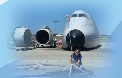
Air & Space

Children entering Grades K-5 discover the world of aviation in a week-long day camp program! Each topic includes hands-on science and engineering activities, realistic flight simulation, exploration of real aircraft and more in a fun small group setting.