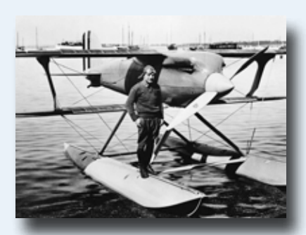
Doolittle and the Curtiss R3C-2

the war building components for Sopwith. After the war Supermarine found its niche building small numbers of seaplanes for the Royal Navy. A Supermarine airplane first appeared at a Schneider Trophy race in 1919, but sank ingloriously after striking debris on landing. Its 1922 entry, the Sea Lion II, remained afloat and dashed the hopes of the Italians, winning the competition and returning the trophy to the United Kingdom.