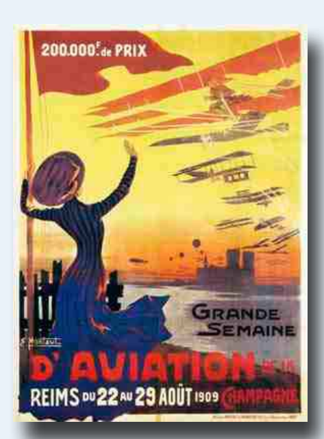
Reims Air Meet Poster

The frail machines flown early in the war were quite similar in performance to the 1905 Wright Flyer, the machine Wilbur and Orville considered to be their first practical flying machine. In contrast, by war's end a proliferation of advanced designs had developed, filling niches in the ecosystem of military aviation undreamed of just a few years earlier.